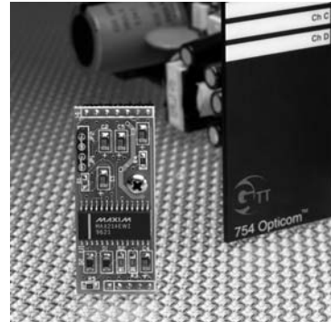
Opticom™ Model 832 Communications Daughter Board