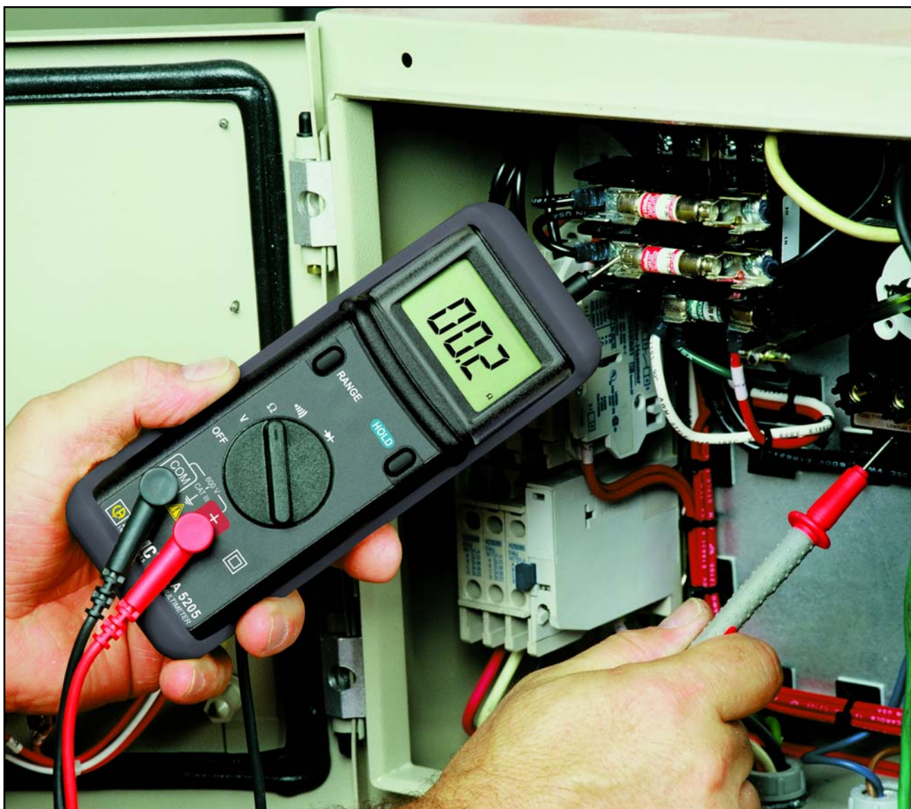
Model CA5205 measuring resistance in a relay cabinet.