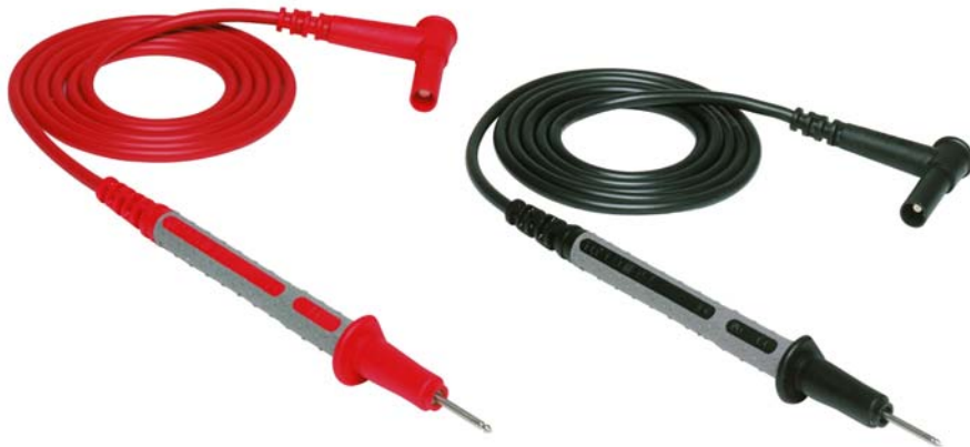
Test Leads included with CA5000 Series