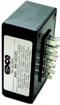
SHA-1250-ITS and SHA-1250-BASE-A (not shown) sold separately.

The SHA-1250-ITS is an upgraded version of the SHA-1210. The SHA-1250-ITS also incorporates two LED's for failure indicator in a modular package (Utilizes 12 pin Beau connector). The hardwire terminal base accommodates all wiring and the protection module is designed for easy replacement. The footprint of the SHA-1250-BASE-A is the same as the ACP-340 and SHA-1210. This makes retrofitting older cabinets easy because internal wire lengths do not have to be adjusted.