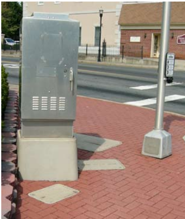
Cabinet shown mounted to a Quazite® traffic signal base along with three Quazite® underground enclosures.