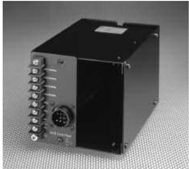
Opticom™ Model 760E Card Rack