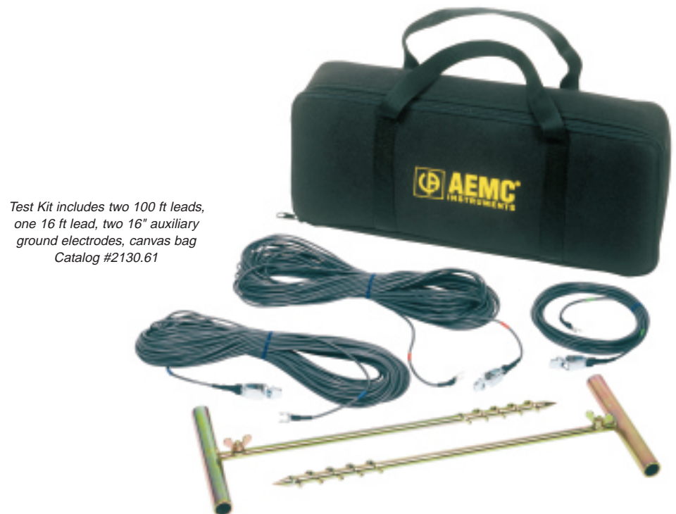
Test Kit includes two 100 ft leads, one 16 ft lead, two 16" auxiliary ground electrodes, canvas bag Catalog #2130.61