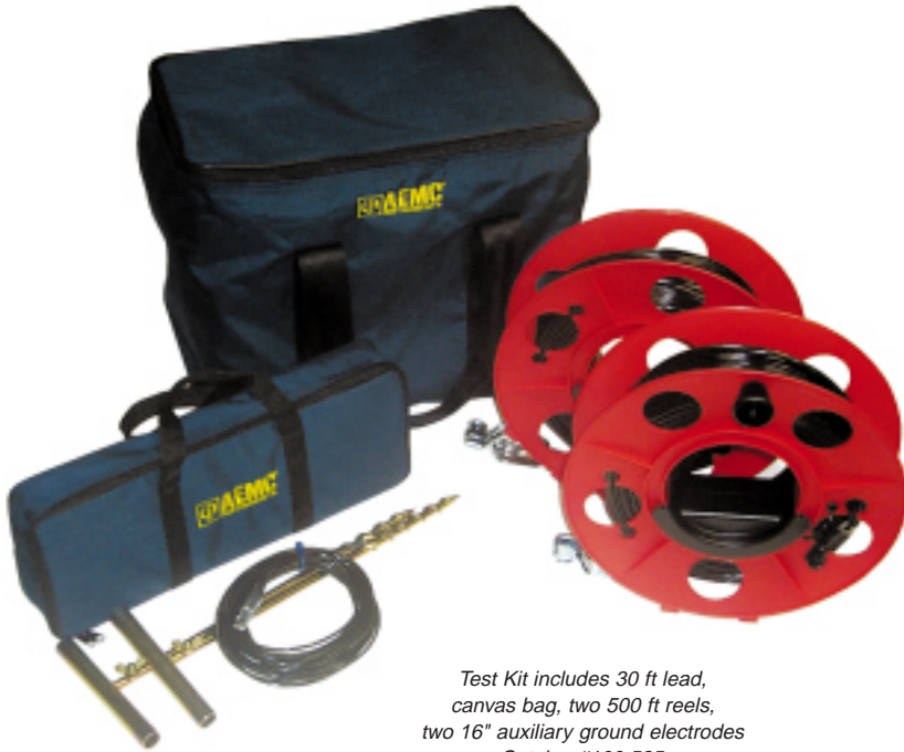
Test Kit includes 30 ft lead, canvas bag, two 500 ft reels, two 16" auxiliary ground electrodes Catalog #100.525