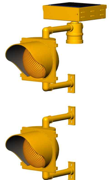
Optional single or dual beacon configuration

Toll-Free: 1-877-722-8877 (North America) Worldwide: +1 (250) 380-0052 Fax: +1 (250) 389-0040 Web: www.roadlights.com