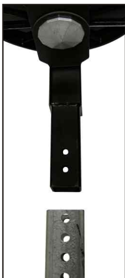
Installs in minutes to 2" square or round sign post